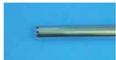
Above- Sharp cutting tip