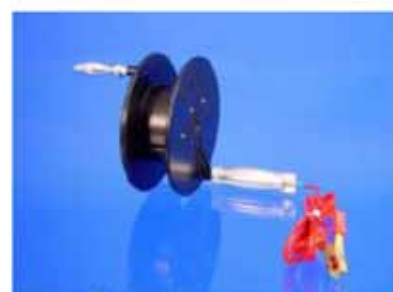
Ex Hand Reel - complete with earthing leads