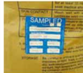
Seal hole with a UA label (See Page 60 for details of our range of UA Labels)

Angle sampler downwards to allow the product to flow into the sample collecting bag