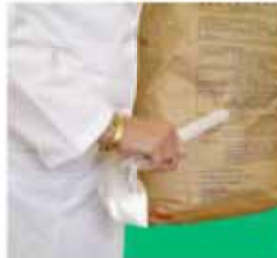
Insert the sampler through the side of the sack.

Angle sampler downwards to allow the product to flow into the sample collecting bag