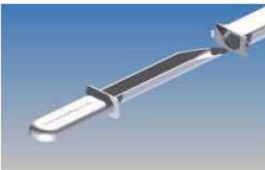
Powder Spatula & Container