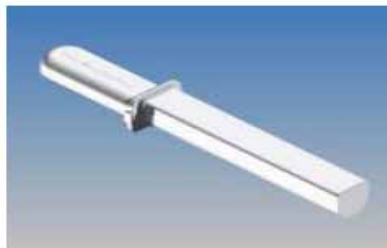
Powder Spatula locked inside the container